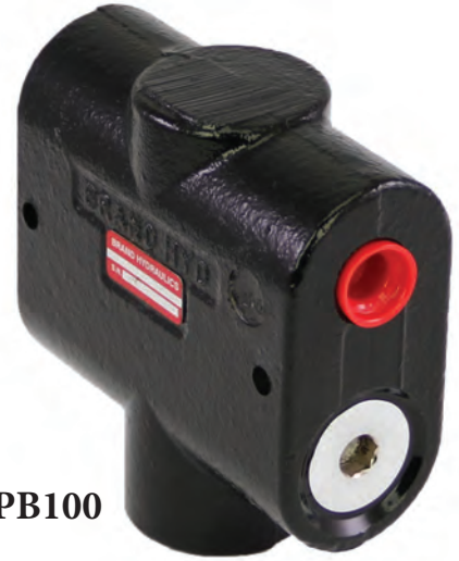
PB50 or PB100